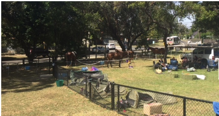
Frenchs Forest Large Animal Staging Area (November 2019)

d) Animal Holding Facilities and Animal-Friendly Evacuation Centres: Specific animal evacuation sites may be opened for the temporary housing of animals. At these locations you will still be