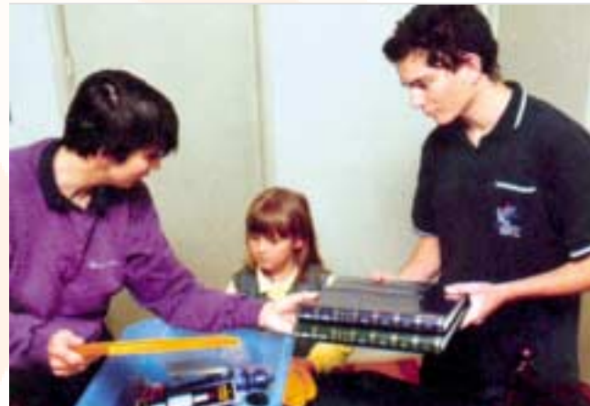
Every family should make an emergency kit.