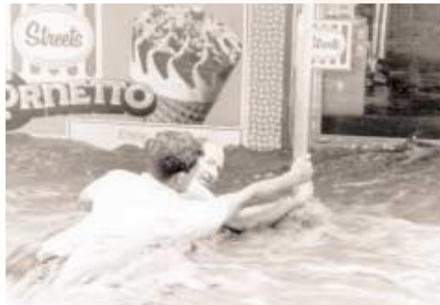
Rescue at the corner of Otho and Evans streets in the 1991 flood.