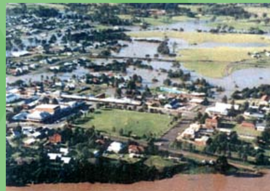
Wingham Green during the 1978 flood

Bureau of Meteorology flood predictions and river height information are available on their website www.bom.gov.au