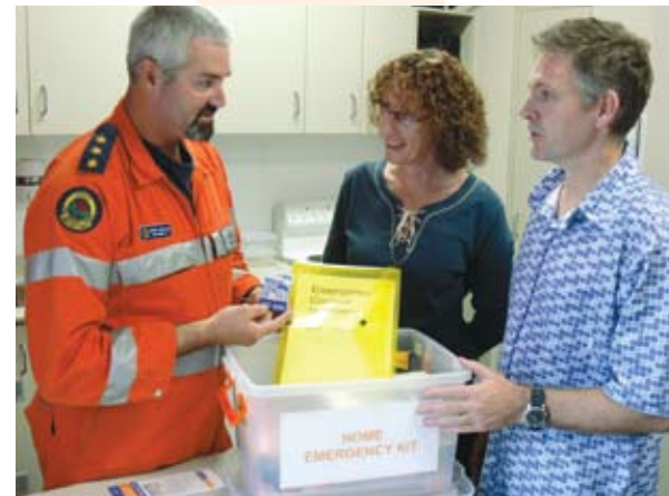
Every home and business should put together an Emergency Kit

Check your insurance policy. Where possible ensure shop fittings can be easily moved or are able to resist water damage. Keep a supply of boxes to move stock and records if flooding is likely.