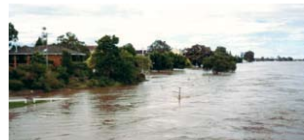
Location: The Manning River during the 1990 flood