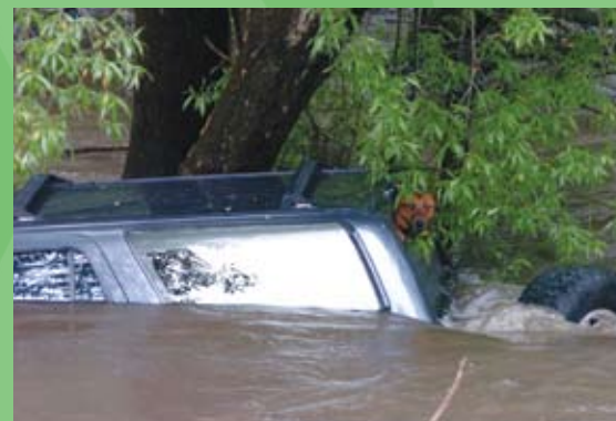
Never drive, ride or walk through floodwater

There are a few simple measures that you can take around your home, unit or property that can reduce the potential damage caused by floods.