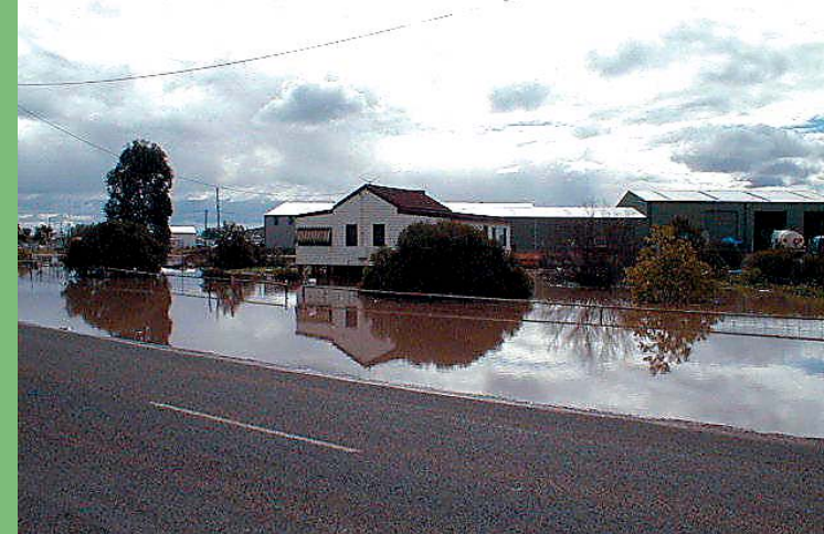
Partially inundated residence, Narrabri