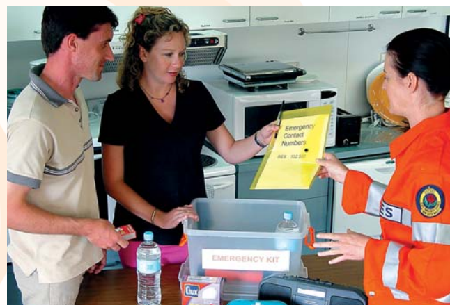
Every family and business should make an emergency kit.