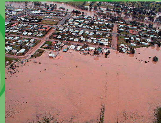
Namoi Street, Narrabri

Bureau of Meteorology flood predictions and river height information are available on their website www.bom.gov.au