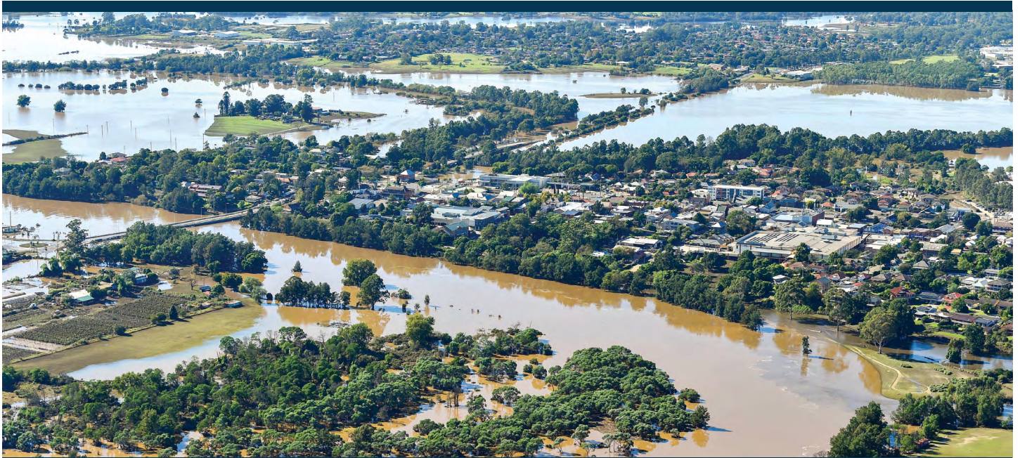
Looking north-east across Windsor during March 2021 floods.