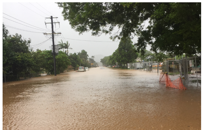
Station St Mullumbimby, 2022 Floods