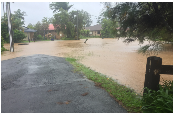
Station St Mullumbimby, 2022 floods

It is important for households and businesses to have an emergency plan. Many Mullumbimby residents may lose access to evacuation routes which can lead to isolation.