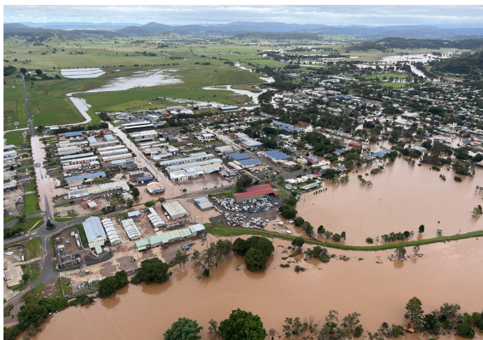
South Lismore Flooding

The levee provides some protection but spills over, or 'over-tops' in larger floods. In 2022, water rose more than 3m above the levee, flooding the suburb and cutting roads such as Casino and Union Streets, requiring large-scale evacuation.