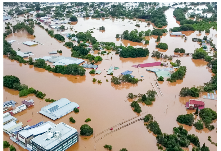
South Lismore flooding 2022.

Every flood is different. While NSW SES can provide guidance on what may occur in future floods, it's important to remember that predictions are not guarantees.