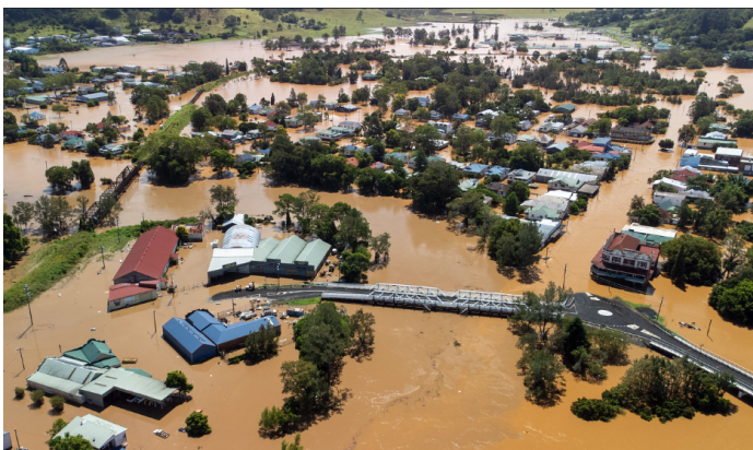
Lismore flooding

Every flood is different. While NSW SES can provide guidance on what may occur in future floods, it's important to remember that predictions are not guarantees.