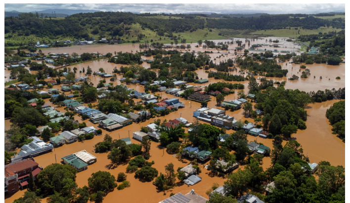
North Lismore floods 2022

Climate change is expected to bring heavier rainfall and rising sea levels, which will make flooding worse in North Lismore. Understand your flood risk, be prepared and make a plan.