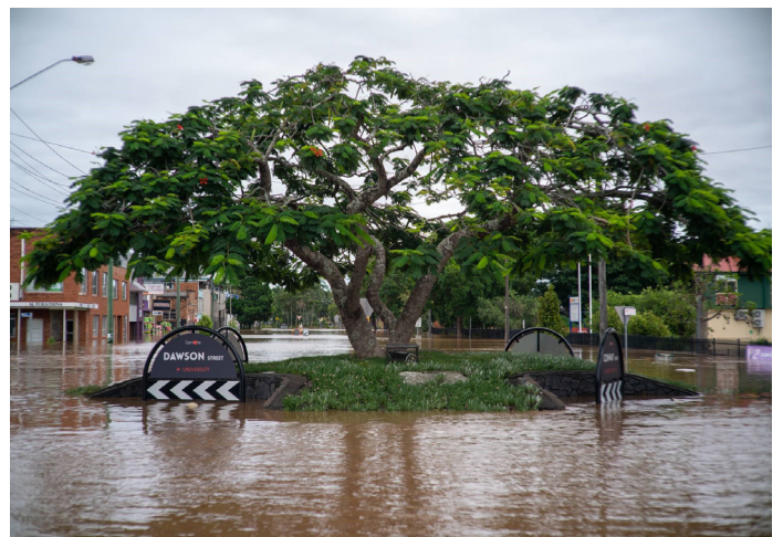
Dawson Street Lismore flooding