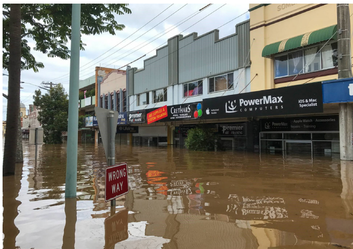
Lismore CBD flooding

Localised rainfall and surface runoff can cause Browns Creek to rise, leading to flooding within the CBD basin.