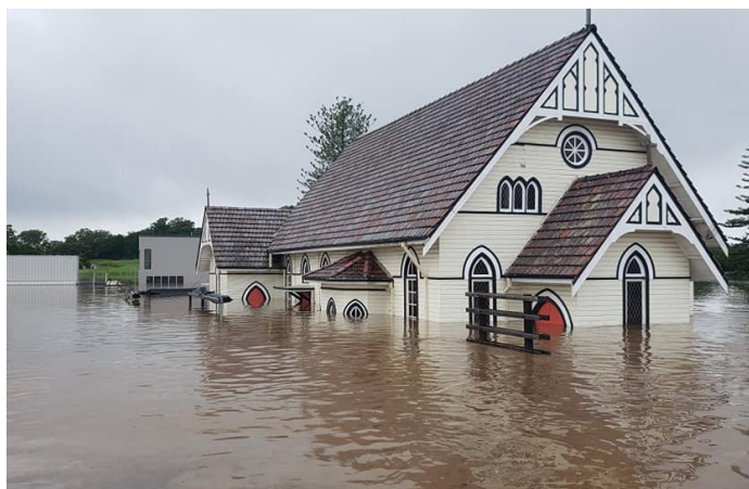
Broadwater Floods 2022

Dozens of homes lost power and were flooded as water remained high for nearly a week. For residents who lived through 2022, while this is not the biggest flood that may occur, it is now the reference point for future flood risk – and it shows why acting before roads close is vital.