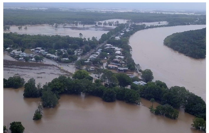
Broadwater 2022 Floods Aerial view

Understand your flood risk, be prepared and make a plan.