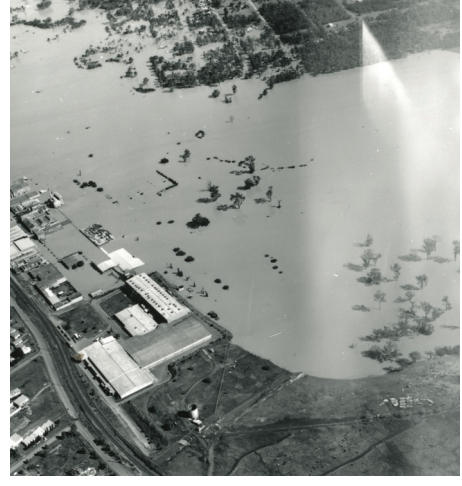
1978 flood at Riverstone