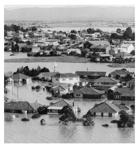
1961 flood in Windsor