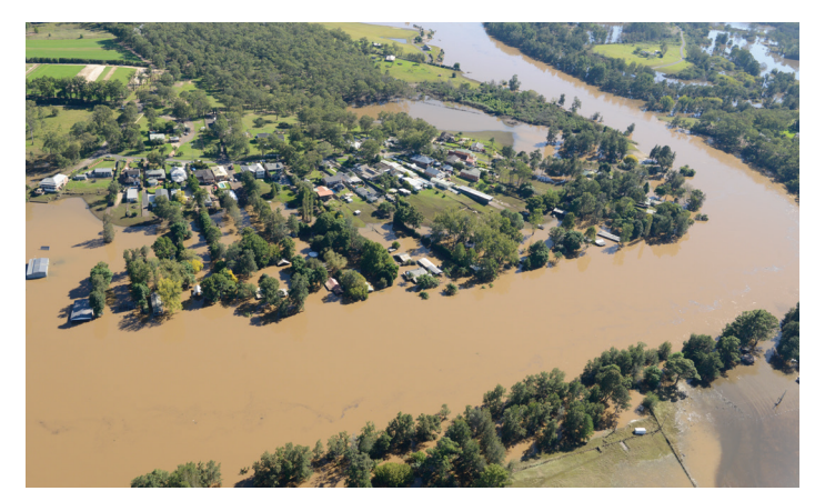
March 2021 flooding at Gronos Point