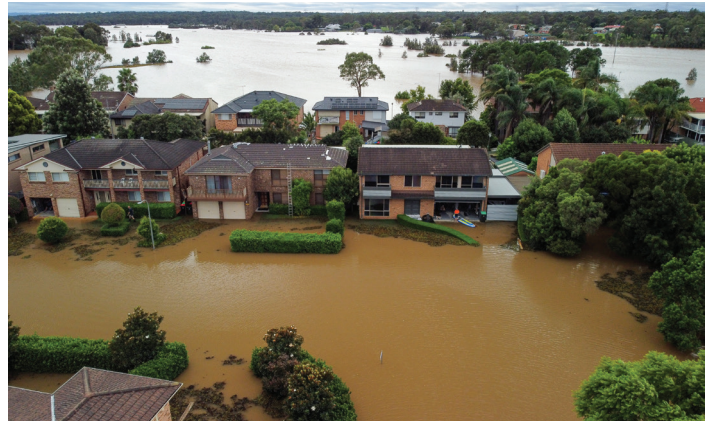
March 2022 flooding in McGraths Hill