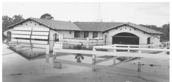
Historical flooding in Londonderry

The largest flood on record for Londonderry was in 1867, peaking at 19.7m at Windsor, and was similar to a 1 in 500 chance per year flood. Big, rare floods do happen!