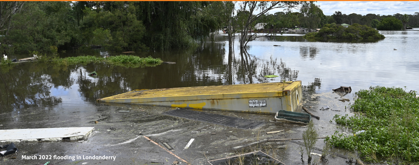
March 2022 flooding in Londonderry

Londonderry is located in the Hawkesbury-Nepean Valley. The Hawkesbury-Nepean Valley covers a wide area in Western Sydney from Bents Basin near Wallacia to the Brooklyn Bridge. The valley has a long history of dangerous and deep flooding. This is because floodwaters flow into the valley more quickly than they can flow out, causing them to back up. Heavy rain caused by an East Coast Low can lead to severe flooding in just a few days.