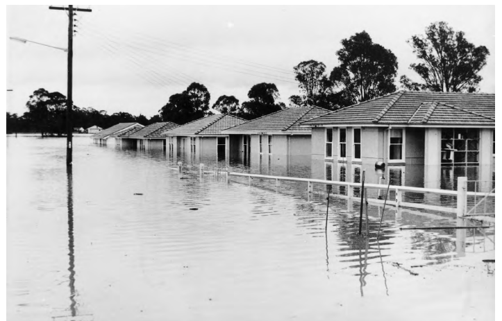
Church Street South Windsor flooding in 1961

The largest flood on record for South Windsor was in 1867, peaking at 19.7m, and was similar to a 1 in 500 chance per year flood. Big, rare floods do happen.