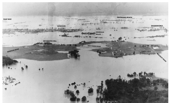
Black and white aerial photo of McGraths Hill flooded in 1961

If a 1 in 100 chance per year flood happened (which has a 1% chance of happening each year), modelling indicates that McGraths Hill would be completely submerged and evacuation routes would be cut. There are some maps showing this flood extent on the next page, comparing it to recent floods.