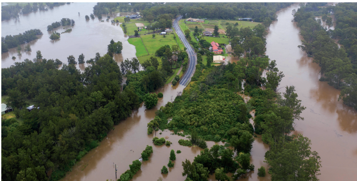
Flooding in the Hawkesbury Nepean Valley March 2021.

This resource was developed through a partnership with NSW State Emergency Service, Infrastructure NSW, Hawkesbury City Council, The Hills Shire Council and Penrith City Council, in collaboration with caravan parks in the region. This project was developed as part of the Hawkesbury-Nepean Valley Flood Risk Management Strategy.