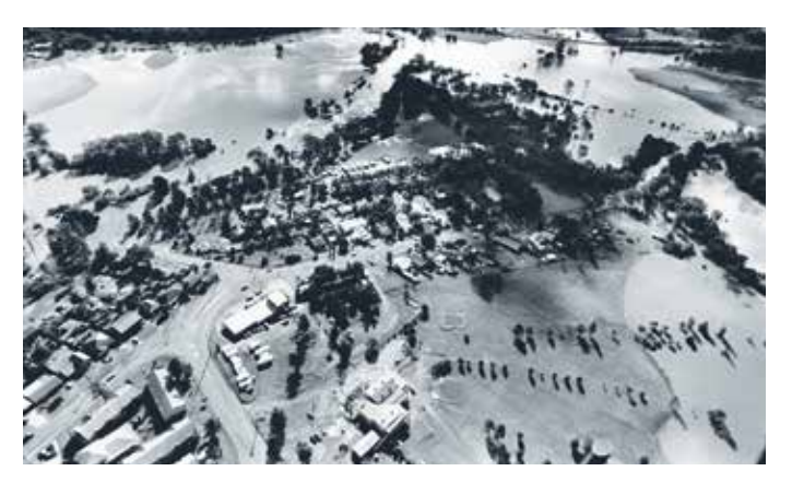
Wallacia flooding, August 1990.