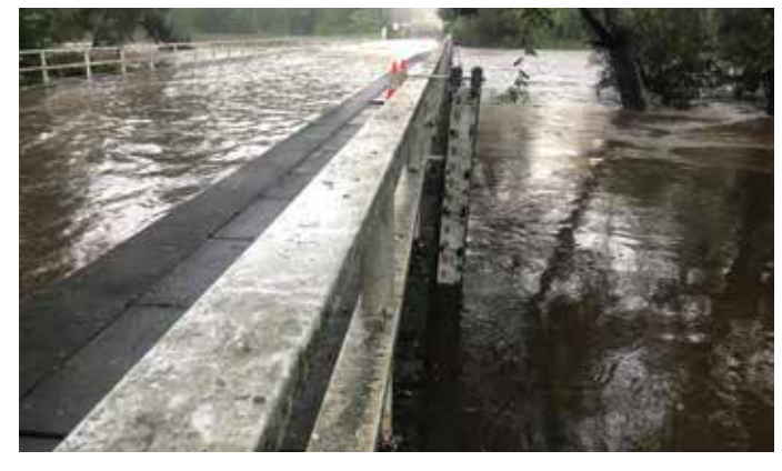
View of flooded Silverdale Road Bridge, Wallacia, March 2021 flood.

Floods are random, naturally occurring events. It's impossible to predict when the next major flood will happen. History has shown that serious floods can happen many times in a single decade, and not again for many years.