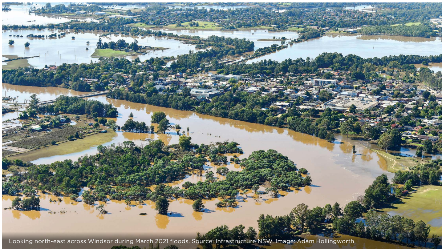
Looking north-east across Windsor during March 2021 floods.