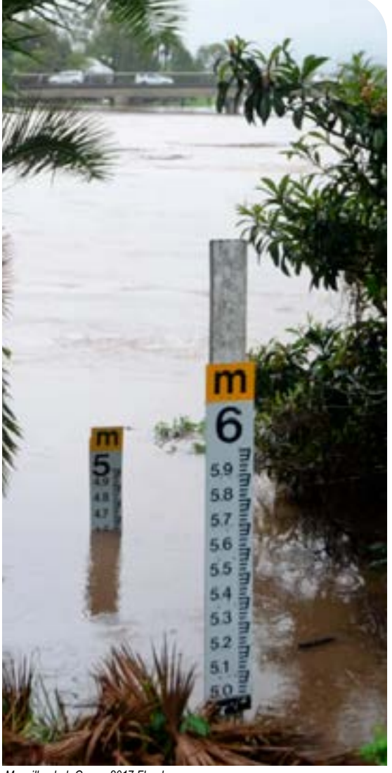
Murwillumbah Gauge 2017 Flood