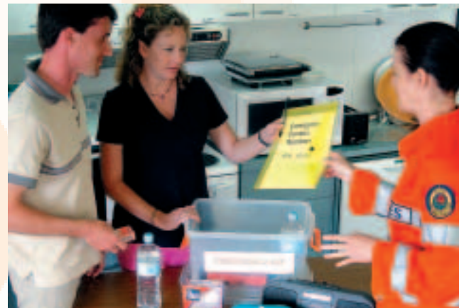
Every family should make an emergency kit.

Generally flood insurance is not available in NSW. You should check your insurance policy. Where possible ensure shop fittings can be easily moved or are able to resist water damage. Keep a supply of boxes to move stock and records if flooding is likely.