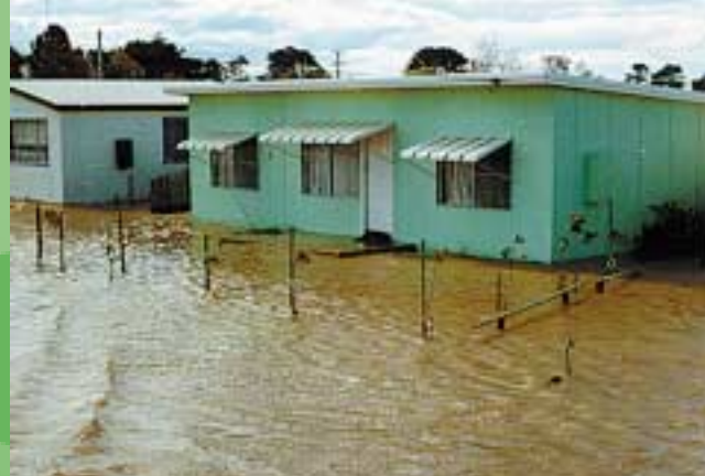
• Home in Greenwell Point in the 1974 flood

You can also be indirectly affected by flooding even if your property is actually inundated. If access roads are cut or you have no power or water, you need to know what to do for yourself – and where to turn for help.