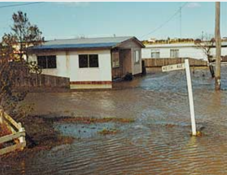
• Greenwell Point and Orient Point can experience serious flooding.